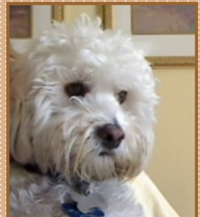
Skip as he looks today.