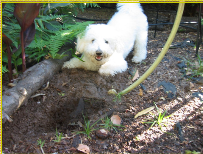
Wasn't me! Really! Look at my paws!