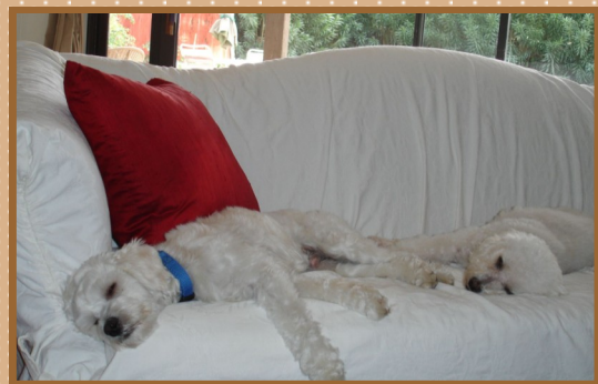
Skip, (in foreground) and Bicci dozing and snoring during their afternoon snooze.

My hope is my story may help others avoid my mistakes. Patience is a Virtue!