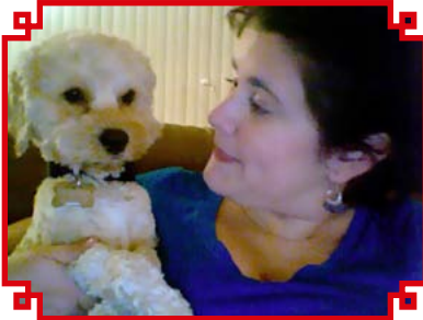
Our first photo together

Every day I am grateful that Rocco was rescued. I can't imagine my days without him. I am so thankful for the Bichon FurKids volunteers who took him from the shelter, cared for him and fostered him until I came along. They saw a dirty, shaggy and fearful beast in the shelter and saved him so that he could be my friend and baby and protector.