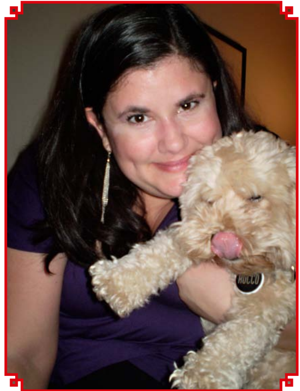
Two years later

And what a good boy he is! He never gets into the trash or chews the furniture or poops on the floor. When I start to stir in the morning, as the alarm goes off, Rocco plops himself down on my chest for a few solid minutes of hardcore snuggling. Ear rubs. Tummy tickles. It's an awesome way to greet the day.