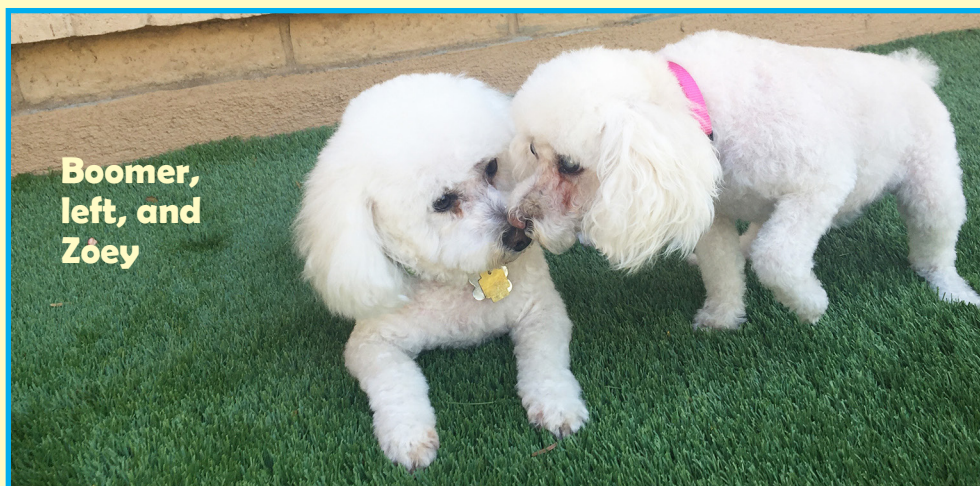
Boomer, left, and Zoey