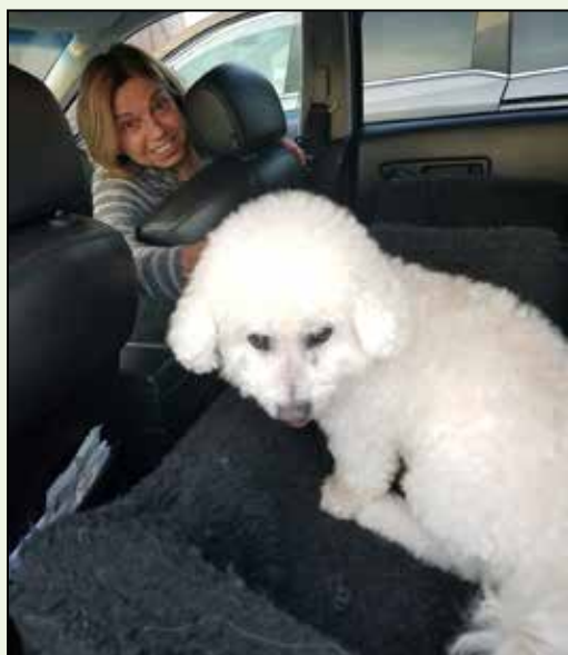
In the car on the way to get a harness