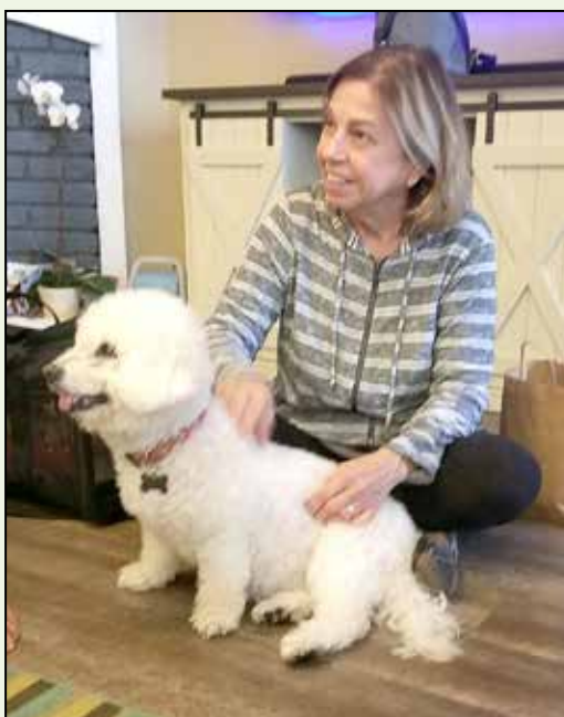
Getting to know one another...and taking in this amazing home!

people of all ages. It was obvious to the shelter staff that Nana had lived with a family before coming to the shelter – but what happened to them and why was she here?