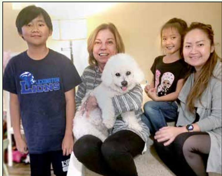
Abbie with Mom and foster family