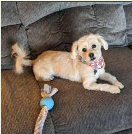
Lucy—all grown up!